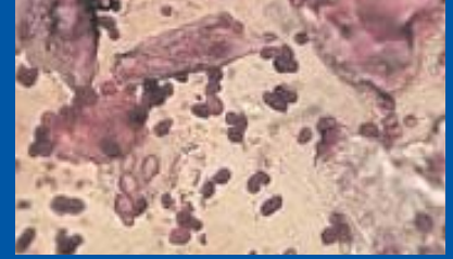
Malassezia overgrowth cytologic picture (x1000)