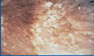
Severe flaky seborrhea